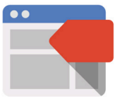
Google Tag Manager