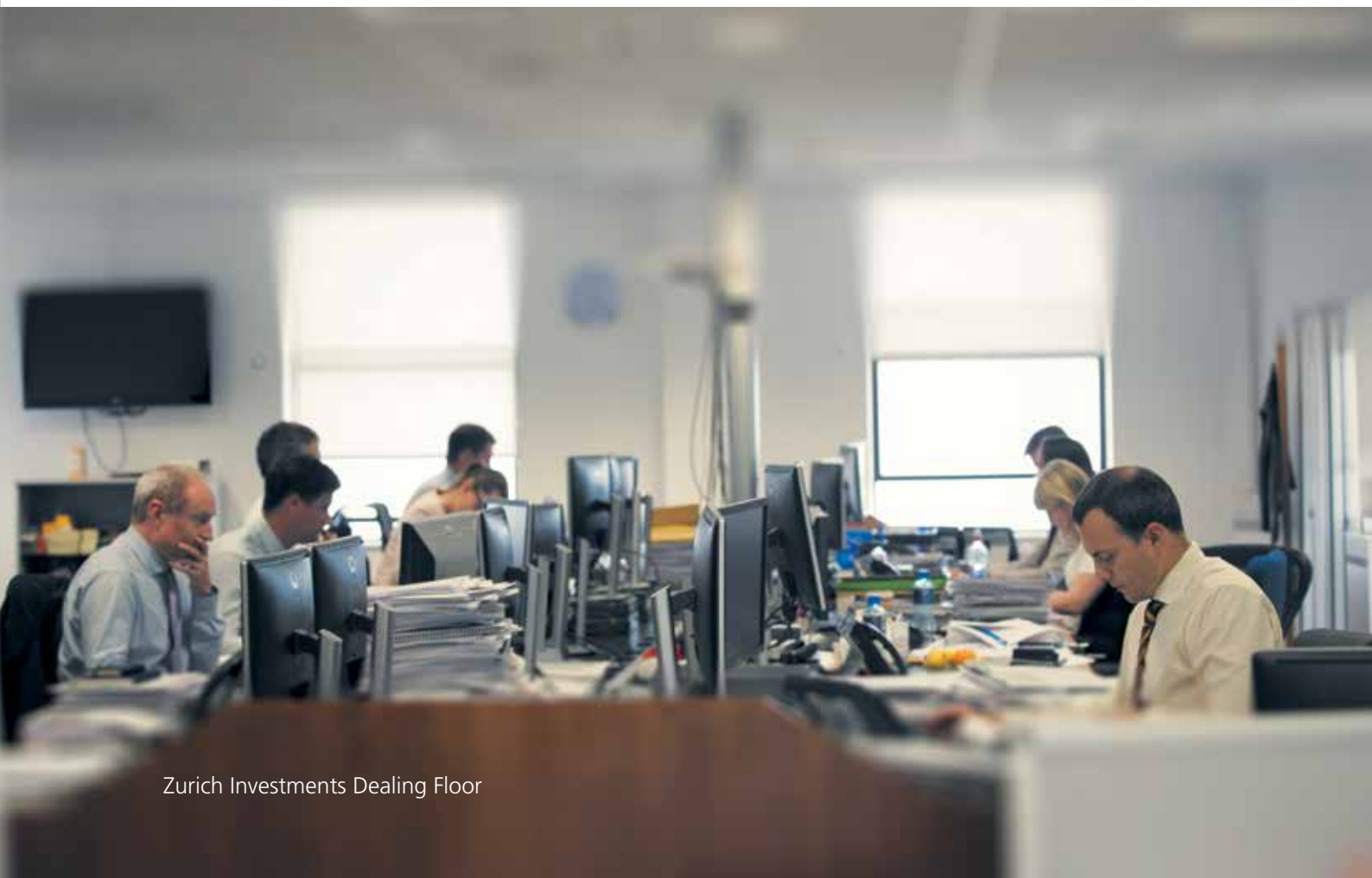
Zurich Investments Dealing Floor

As a result, our dealing floor is a busy place; discussion is ongoing, with the team taking a forward looking, proactive approach.