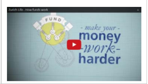
How savings & investments works