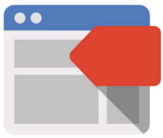
Google Tag Manager